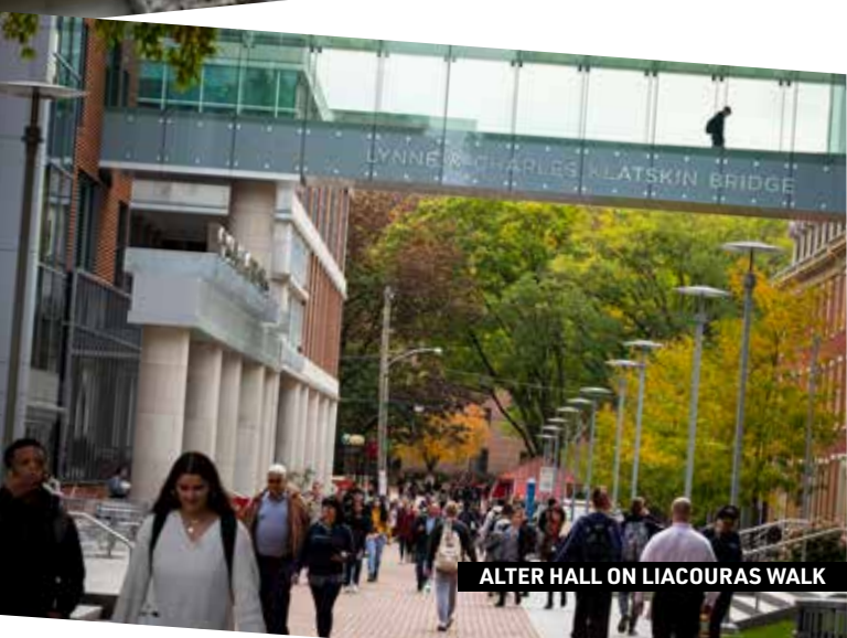
ALTER HALL ON LIACOURAS WALK

These spaces are must-see spots for anyone visiting campus and are easily accessible for all. Please note that Temple's campus is secure and most other buildings require identification to enter. If you want to go inside academic buildings and residence halls, please schedule a tour with the Welcome Center (#69 on map).